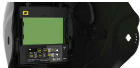
High optical class ADF, with color touch screen interface