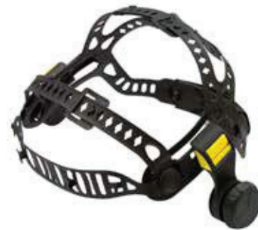
Halo Comfort 5 Point Harness (front view)